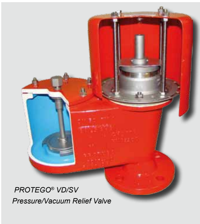
PROTEGO® VD/SV Pressure/Vacuum Relief Valve

PROTEGO® Pressure/Vacuum Relief Valves require only 10 % overpressure to reach full lift. This means that our valves open at higher pressures and reseal earlier resulting in less vapor losses.